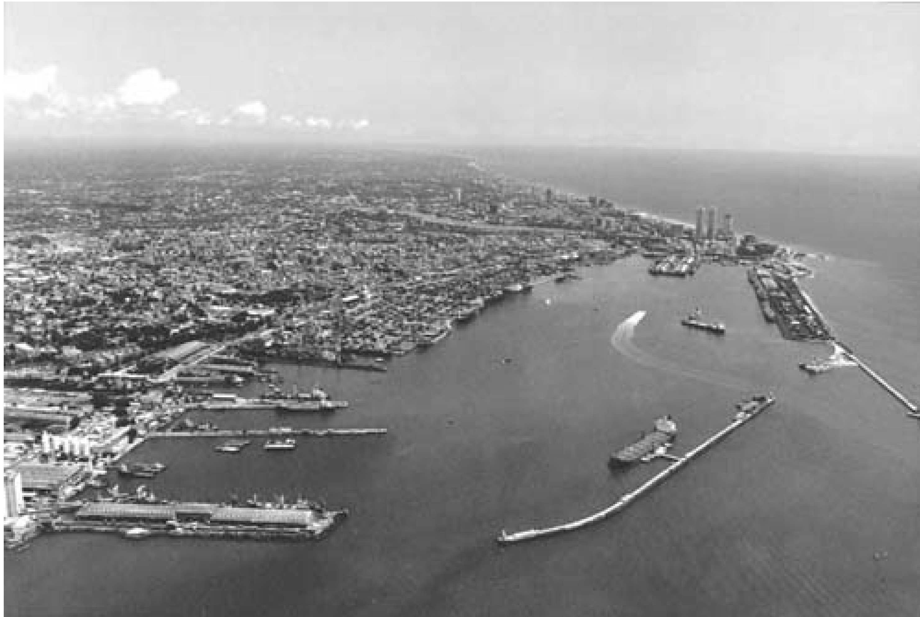
Port of Colombo, Sri Lanka, site of the "Colombo Plan". Japan assisted the port's expansion and improvement through yen loans and various other measures

Drawing on prewar and wartime colonial engagements, bilateral technical and economic assistance quickly emerged as a key element of Japan's foreign policy towards the fledgling nation-states of Asia in the early postwar period. Gradually integrated into institutionalized frameworks such as Official Development Assistance (ODA) , these aid programs have helped to foster industrial and educational development whilst simultaneously advancing economic and diplomatic objectives of the donor nation. Japan's ODA policy towards Asian countries has often prioritized initiatives focused on technical education and the development of educational infrastructure.