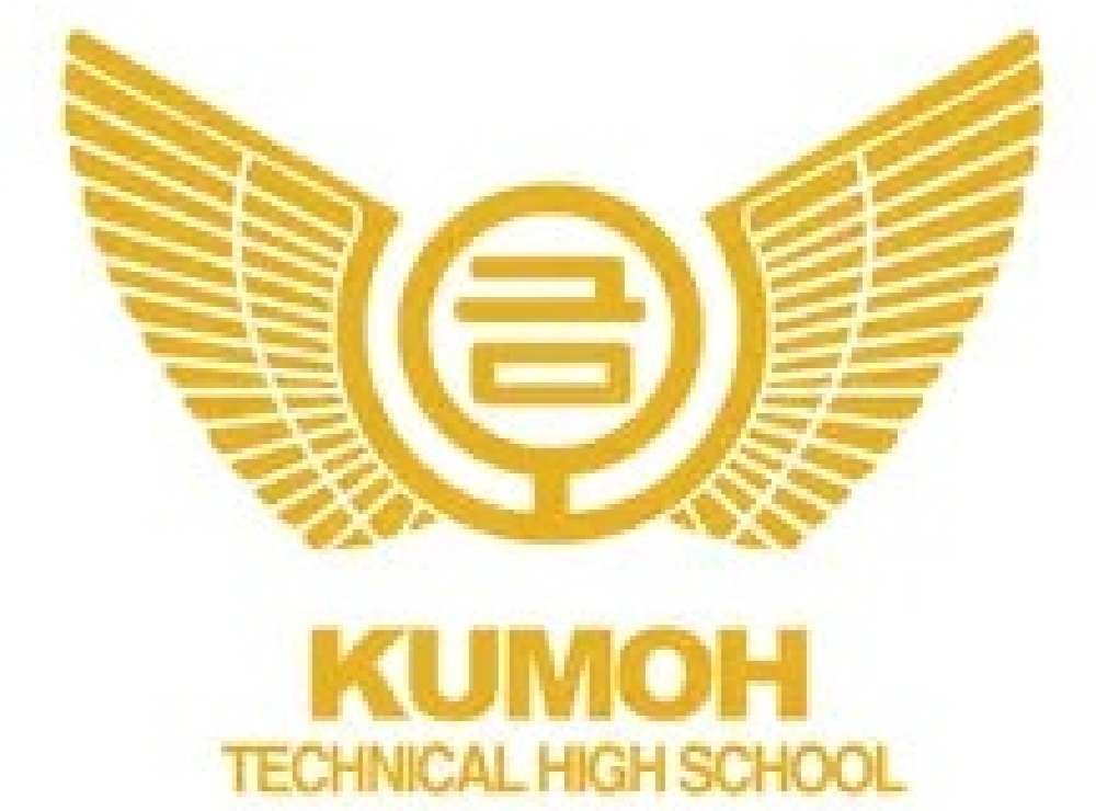
Kumoh Technical High School (금오공업고등학교), South Korea, 1972

The project explores the dissemination, implementation, and adaption of Japanese technical assistance and education by various stakeholders — including public and private actors and organizations in both recipient countries and Japan — based on case studies in South Korea, Singapore, Thailand, and elsewhere.