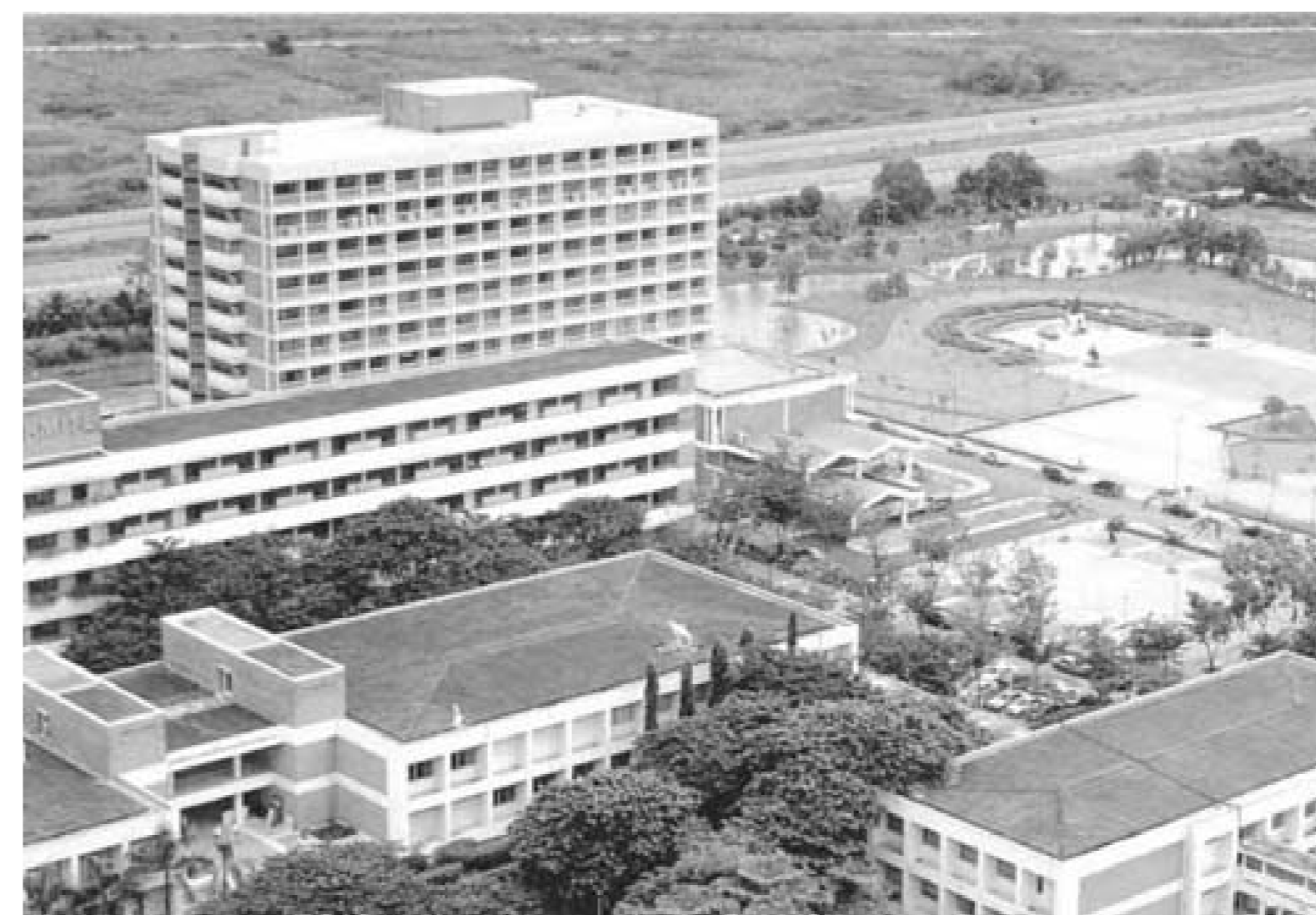
Nonthaburi Telecommunication Training Center, Thailand, 1960