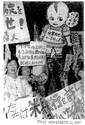
Fig. 4: The Kewpie Doll