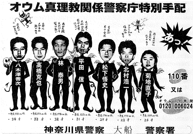
Fig. 6: Wanted-poster of Kanagawa Pref. police offices