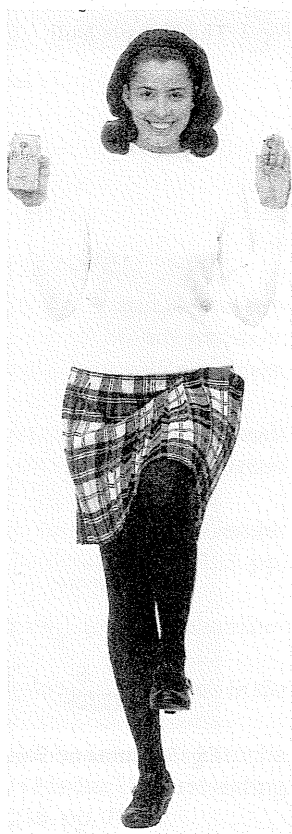
Fig. 2: The 'Pekoe Pose'