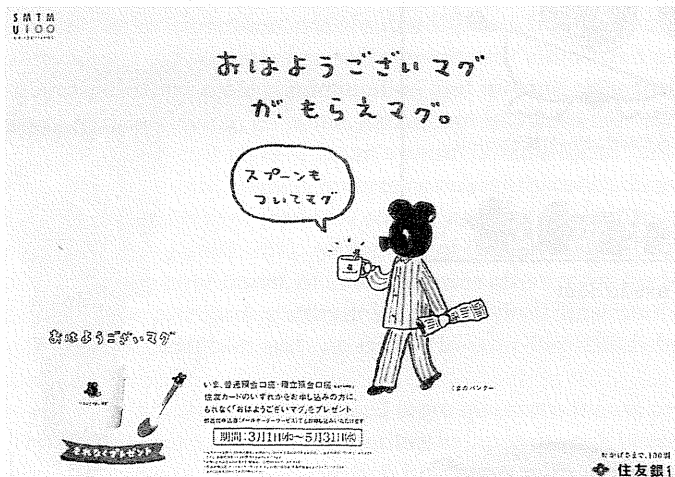
Fig. 5: 'Kuma no Bankō'