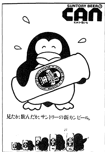
Fig. 1: Tuxedo Sam

consciously perceived as such by the audience, and how much of it has ceased to be defined as cute? And how much of Japan's cuteness is being perceived as such only by the outside observer? In this respect, this paper is only a starting point. From advertising, where cuteness has proved an important manipulative instrument, the next step would be to see if cuteness proves similarly efficient in the manipulation of other communicative situations in Japan. All that can be said for sure right now is that there is enough time to investigate this matter, as it will be a long time before Japan's cuteness runs out of steam.